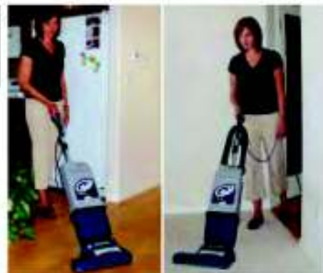
ProCare Series vacuums work equally well on either hard floors or carpets.